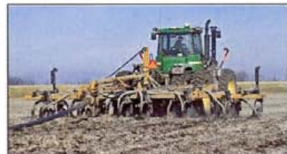
30° FOLDING TOOL BAR

With a Farmstar Direct Injector System, you can precisely control the gallons per acre application of liquid manure. We have No-till, Minimum-till, and Wide Sweep Injectors. Our Direct Injector Bars are available in 5, 7, 9, and 11 shanks making these perfect for any size of operation.