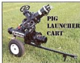
PIG LAUNCHER CART