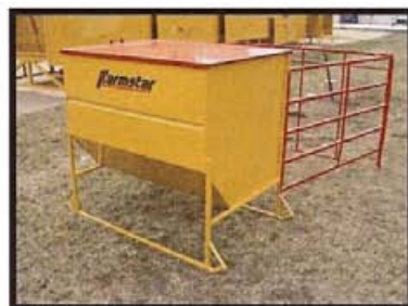
20 BU w/Pen