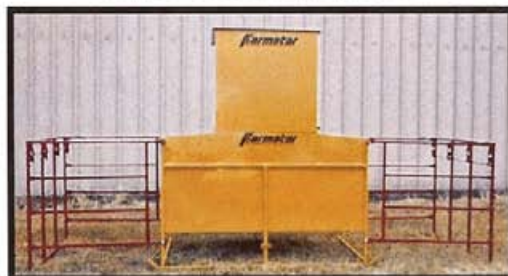
40 BU w/Pens & Tower

Our Creep Feeders are made out of HEAVY Steel Construction