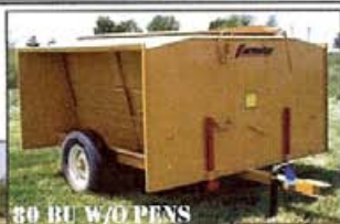
20 BU W/PENS