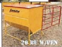
20 BU W/PEN