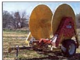
7 HOSE REEL