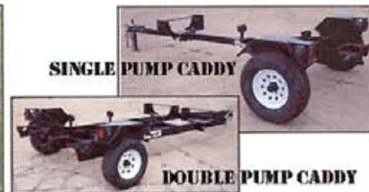
SINGLE PUMP CADDY