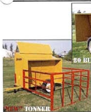
80 BU W/PENS