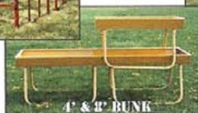
4' & 8' BUNK

We have a full line of feeders. We carry 20 BU, 40 BU, Tonner, 80 BU, 150 BU, and 300 BU Creep Feeders. We carry 150 BU Steer Finisher. We have 4', 8', and 12' Bunks that are available with or without Hayracks. Our Creep Feeders are made out of Heavy 12 GA steel construction, painted inside and out.