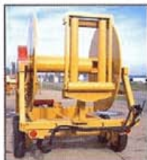
10 HOSE REEL

Hose Reels from 2 Hose to 10 Hose. Open faced like the 7 Hose and the 10 Hose, or with dividers on the 2,3, and 4 Hose. Call for list of options and standard features.