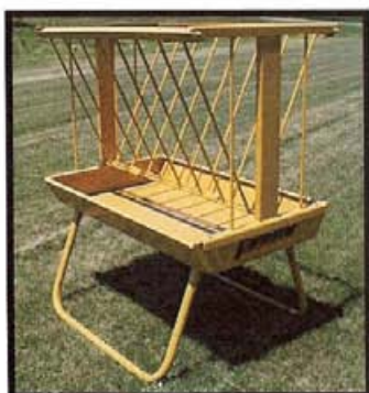
4' Bunk & Hayrack