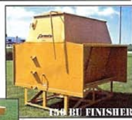
150 BU FINISHER