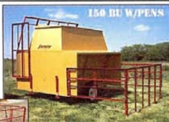
150 BU W/PENS