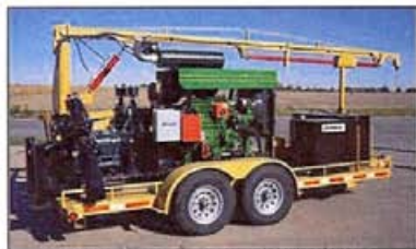
200 HP JOHN DEERE ENGINE

Pumping Engine with Boom—Trailer complete with John Deere Engine, Cornell Pump. Shown with the following Options: