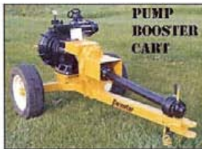
PUMP BOOSTER CART