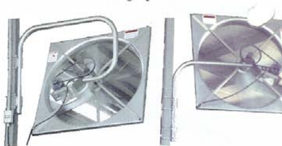
24-0488 Style 4G Fan Hanger Tube